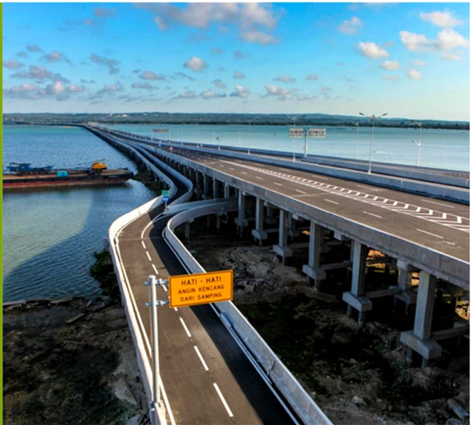
Bali Mandara Toll Road

Get up close and personal with Bali's wildlife on this thrilling nature tour. Combine a heart-pumping white-water rafting experience on the spectacular Ayung River with an elephant safari adventure.