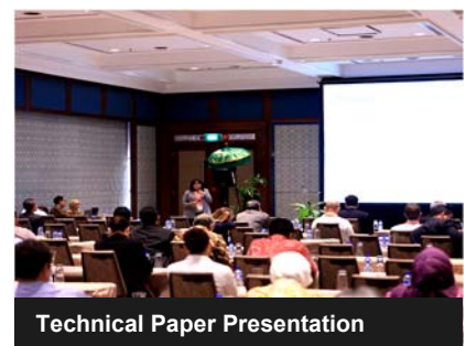
Technical Paper Presentation

More information are available in separate booklet on 'Preparing Papers for 15 th REAAA Conference'. The document can be requested from conference@reaaaindonesia.org