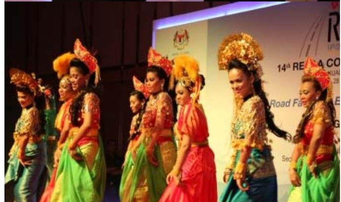
The REAAA Conference is held every two to four years

members and associates in 118 countries, the IRF promotes social and economic benefits that flow from well planned and environmentally sound road transport networks. It helps put in place technological solutions and management practices that provide maximum economic and social returns from road investments. Through the International Road Educational Foundation, the IRF also awards grants to graduate engineers and other transportation professionals from around the world in support of full-time academic training. With this, the IRF actively supports future generations of industry leaders.