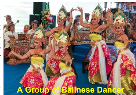
A Group of Balinese Dancer

Indonesia is the world's largest archipelago, comprising of more than 13 thousand islands, straddling the equator, situated between the continents of Asia and Australia and between the Pacific and the Indian Oceans, stretching from east to west with a length of 5,200 km and a width of 1,870 km. Indonesia has a total population of more than 240 million people (2015) from more than 200 ethnic groups. The national language is Bahasa Indonesia. Culturally, Indonesia fascinates with her rich diversity of ancient temples, music, ranging from the traditional to modern pop, dances, rituals and ways of life, differ from island to island, from region to region. Yet everywhere the visitor feels welcomed with that warm, gracious innate friendliness of the Indonesian people that is not easily forgotten.