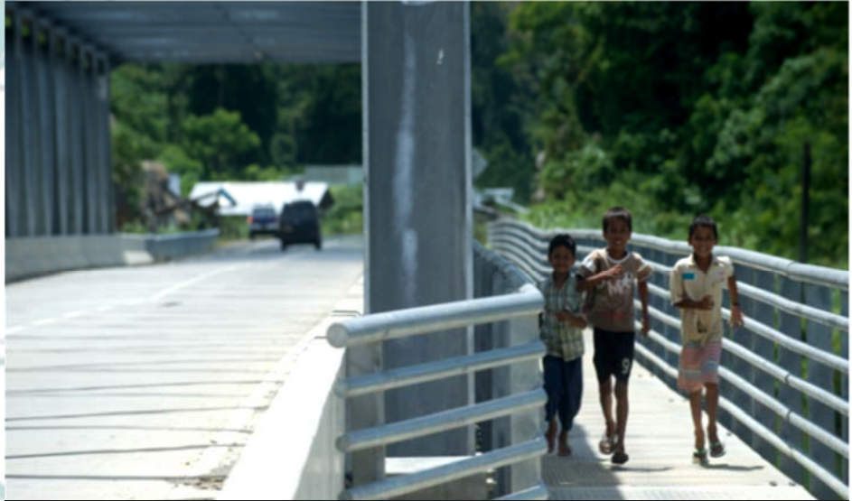
Children walking safely in pedestrian bridge in Aceh Province, Indonesia

The technical sessions in this conference have been formulated to discuss about the problem, challenges, and alternative solutions. Come and be informed on the required quality road infrastructure of the future.