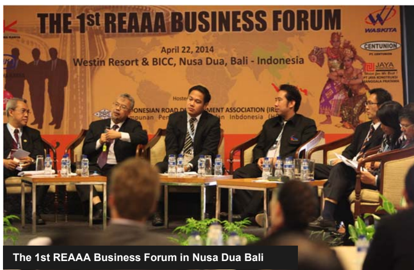
The 1st REAAA Business Forum in Nusa Dua Bali

* The general conference registration fee doesn't include the Business Forum Meeting